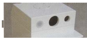
4 Suction pipe connections, for every job