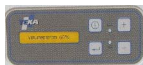
Display with text indicator