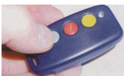
Remote control for switching on and off and for regulating performance