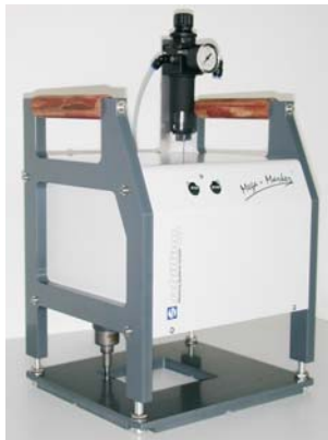
Portable Version (Optional) With handles and ground plate, incl. prism